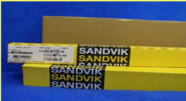
Sandvik TIG Wire in 30 lb Master Carton